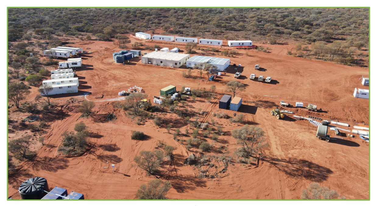
Figure 5: Aerial view of Lake Wells Village

This release was authorised by the Board of the Company.