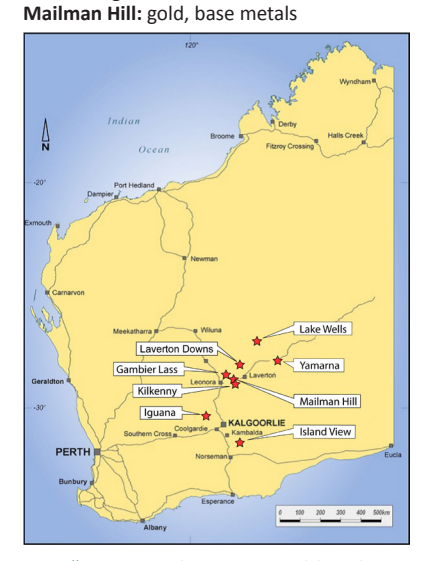
" Targeting large new gold and base metal deposits in overlooked and underexplored greenstone belts in Western Australia"

Lake Wells: gold, nickel, base metals, PGE, uranium Laverton Downs: gold, base metals Gambier Lass: gold, base metals Kilkenny: gold, base metals Iguana: gold, base metals Yamarna: gold, PGE, uranium