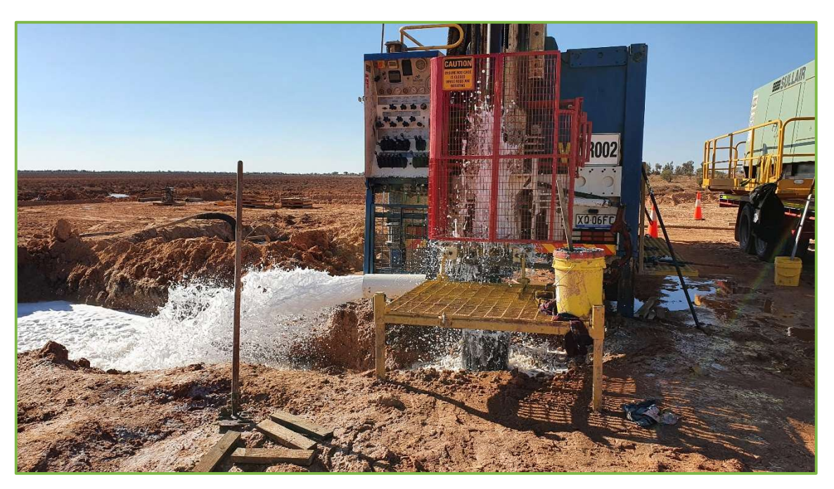
Figure 3: Borefield drilling