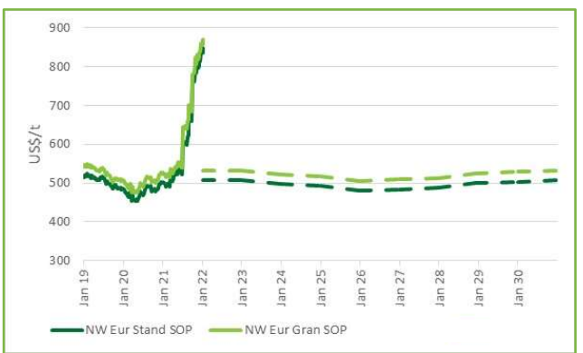
Figure 8: Global Fertiliser Prices<sup>3</sup>