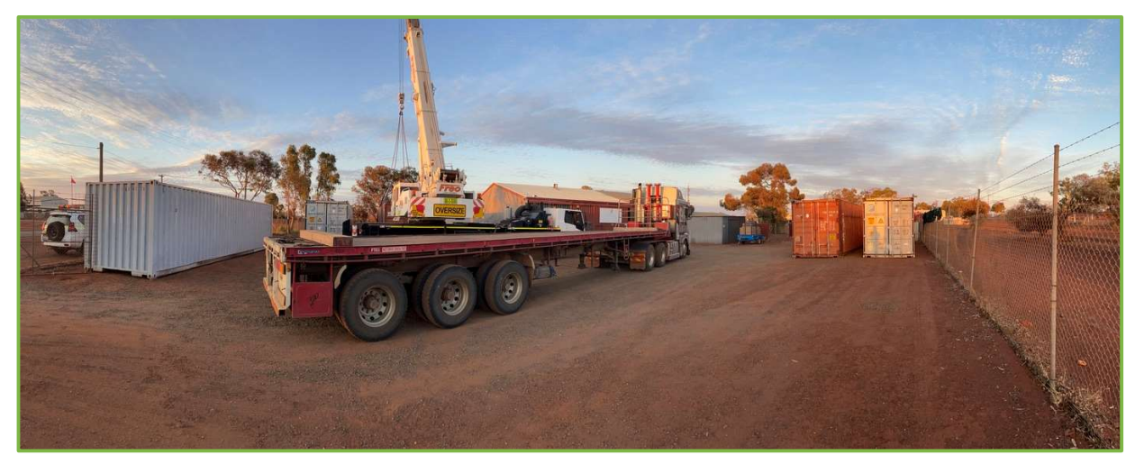
Figure 5: Five 40-foot containers of training equipment, a dome shelter and additional storage equipment being delivered for installation

Refurbishment of the dedicated LTC facility at 2 Crawford Street, Laverton began in August 2021 and is ongoing through early 2022. The initial focus is on improving the existing infrastructure and installing or building the additional infrastructure required to enable the facility to meet its objectives.