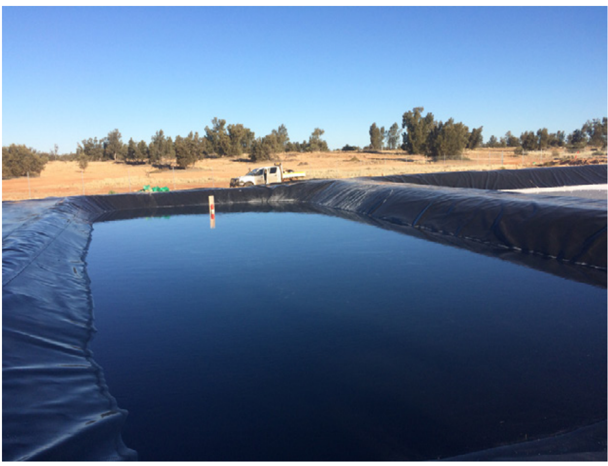
Figure 2: Pre-concentrated brine after transfer into harvest pond 1

As the brine evaporates further through the harvest ponds, various sodium and magnesium salts are crystallised out of it until it becomes highly concentrated with potassium bearing salts. It is anticipated that the final transfer of brine into the final harvest pond will occur towards the end of 2018, resulting in the crystallisation of 'feeder' or harvest salts in the harvest ponds. It is from these blended harvest salts that SOP is processed and refined.