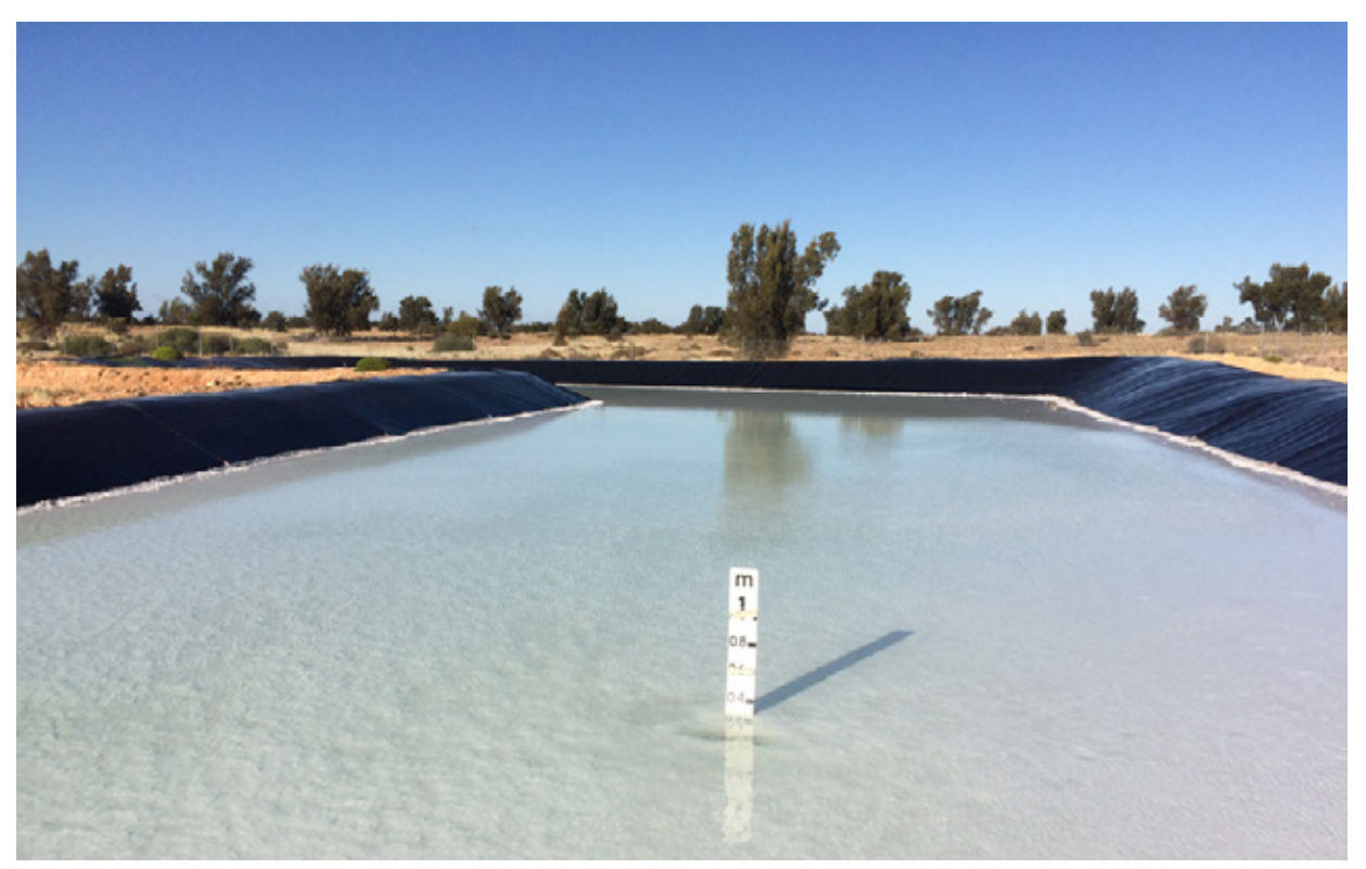
Figure 1: Pre-concentration pond at the Lake Wells SOP project prior to initial brine transfer

Subsequent to year end, on 22 August 2018, APC announced the successful transfer of brine from the pre-concentration pond into the first harvest pond at the Lake Wells Sulphate of Potash project pilot evaporation pond network.