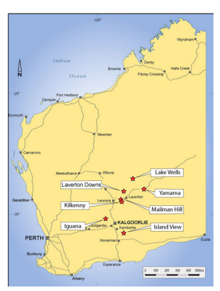
"Targeting large new gold and base metal deposits in overlooked and underexplored greenstone belts in Western Australia."

Laverton Downs: gold, base metals Kilkenny: gold, base metals Iguana: gold, base metals Yamarna: gold, PGE, uranium Mailman Hill: gold, base metals