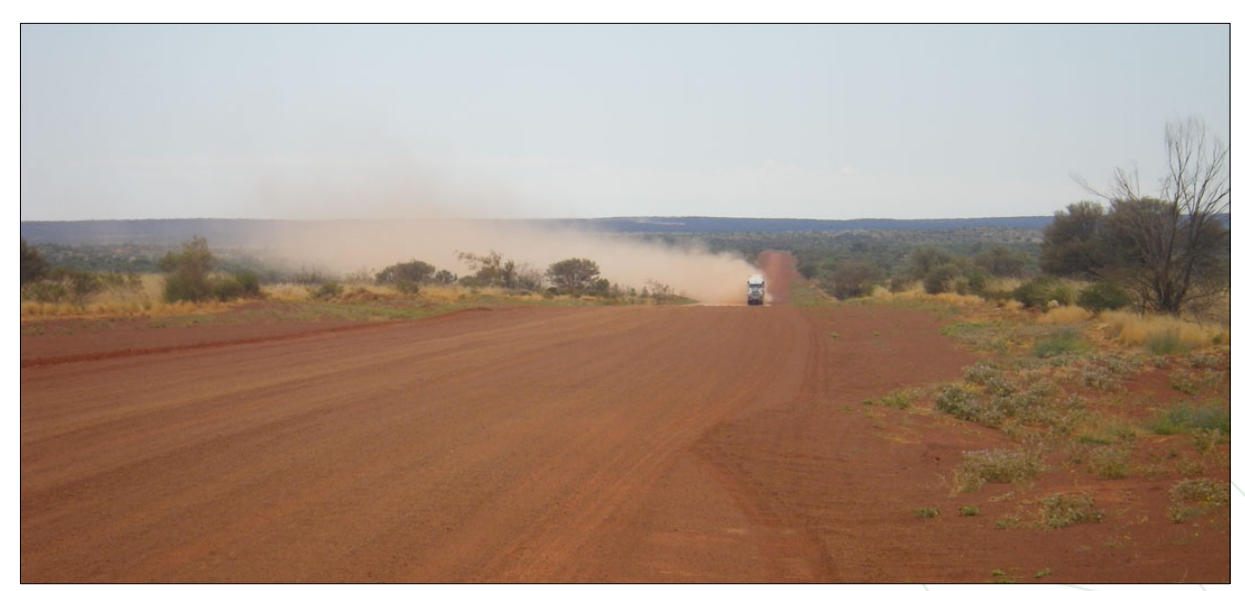
Figure 1: Commencing January 2019, the Great Central Road will be sealed to 100kms east of Laverton