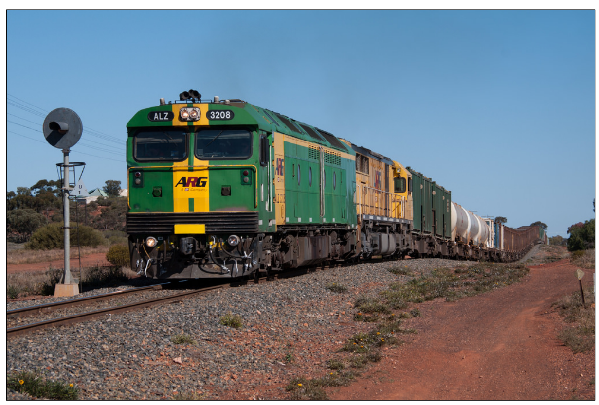
Figure 3: Having an all-weather sealed logistics solution to the rail head at Leonora is likely to generate optimum OPEX once the Lake Wells SOP Project is in operation

"We are working with the Shire to understand the feasibility of a mid-term road sealing project on the Lake Wells Road. Not only does road-haulage on bitumen as opposed to unsealed surfaces indicate an optimised freight solution, but with a 100% sealed road to Lake Wells we could realistically use Laverton as the hub for our operation, avoiding the capital cost of many site-based services."