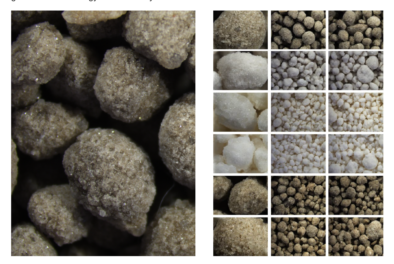
Figure 1: LSOP granulated product showing well-formed granules

FEECO is recognised globally as an expert in process design and manufacturing solutions for complete fertiliser systems and turnkey production facilities including bulk material handling, granulation technology and control systems.