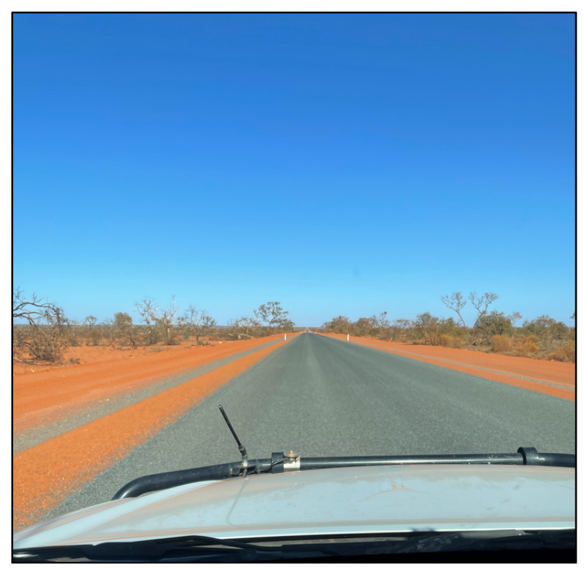
Figure 7: The Great Central Road hard-surfacing program is approaching completion, significantly improving the LSOP's road access