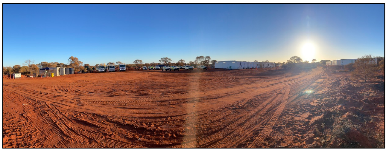
Figure 1: Lake Wells Village

Australian Potash Limited (ASX: APC or the Company) is pleased to provide this project update on the development of the Lake Wells Sulphate of Potash Project (LSOP) and scheduled activities for Q3 2021.