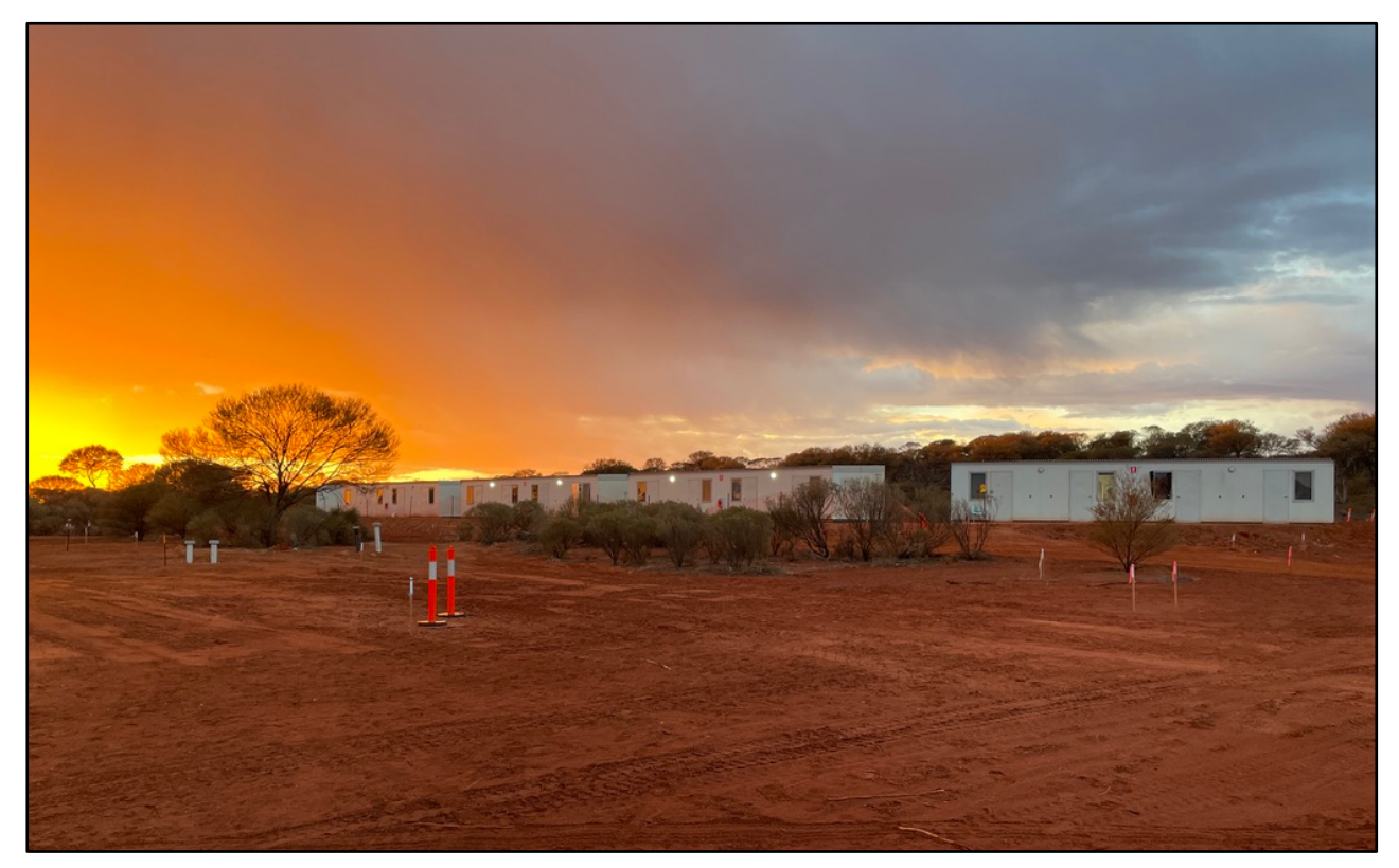
Figure 3: Lake Wells Village permanent accommodation units