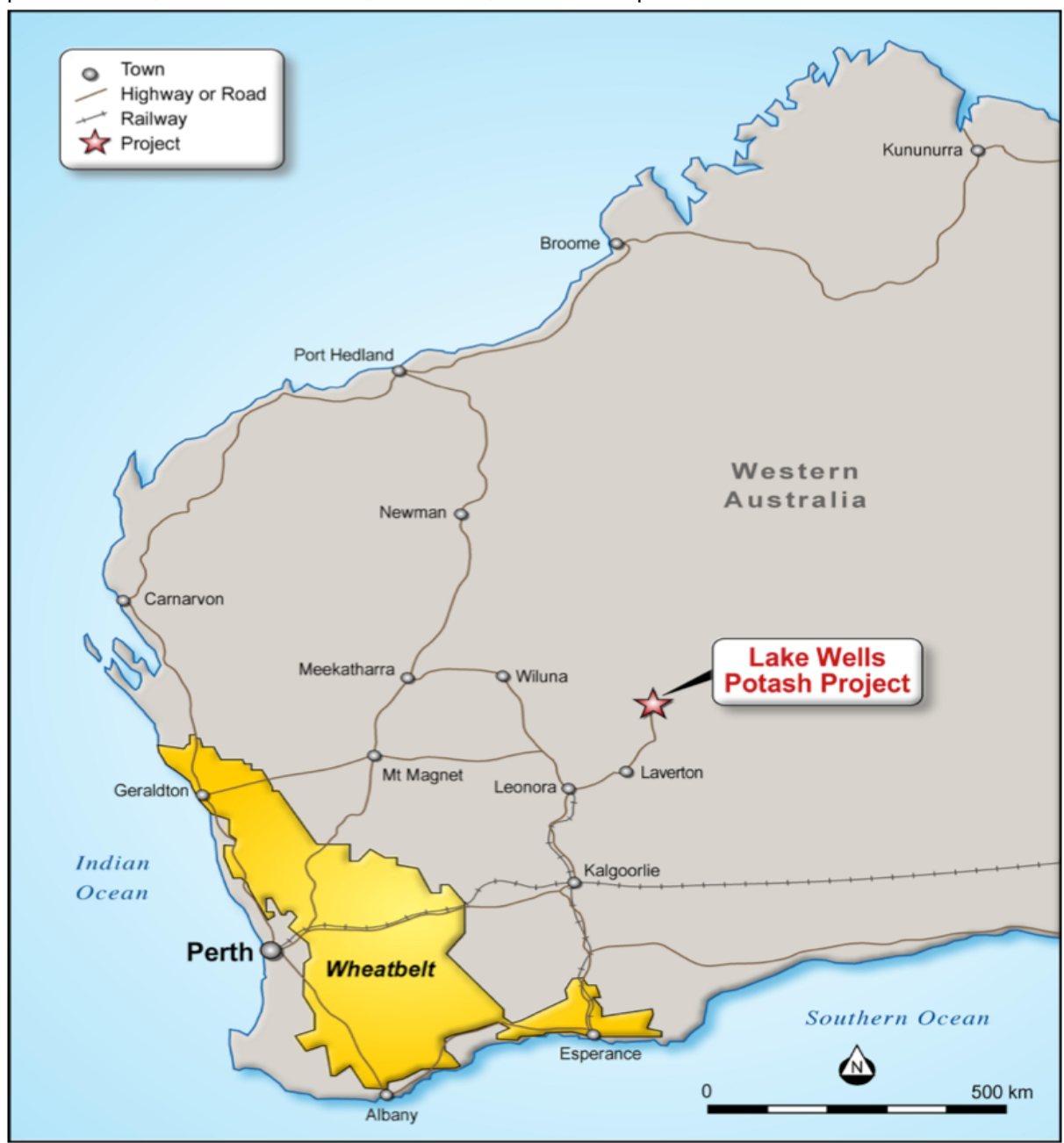
Figure 1: The Lake Wells Potash Project is ideally located to end users and distribution centres

Goldphyre Resources' ('Goldphyre' or 'the Company') 100 percent-owned Lake Wells Potash Project is a brine-hosted sulphate of potash (SOP) project located in the Eastern Goldfields region of Western Australia (Figure 1). Goldphyre aims to supply the Australian domestic demand for SOP. Australia currently imports 100 percent of all potash used, estimated at 500,000 – 600,000 tonnes per annum.