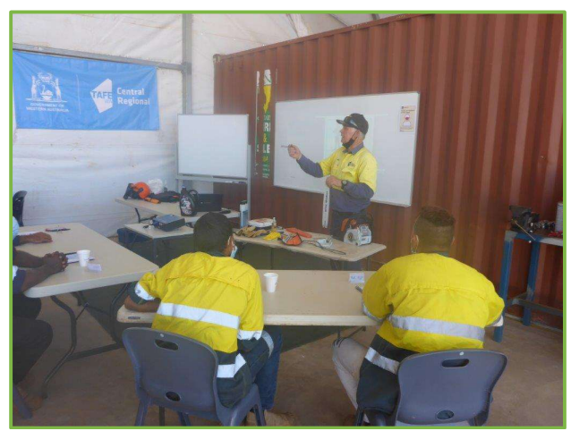
Figures 4 & 5: First training at the LTC – chainsaw operations