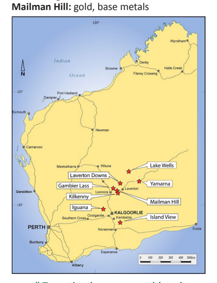
" Targeting large new gold and base metal deposits in overlooked and underexplored greenstone belts in Western Australia"

Lake Wells: gold, nickel, base metals, PGE, uranium Laverton Downs: gold, base metals Gambier Lass: gold, base metals Kilkenny: gold, base metals Iguana: gold, base metals Yamarna: gold, PGE, uranium