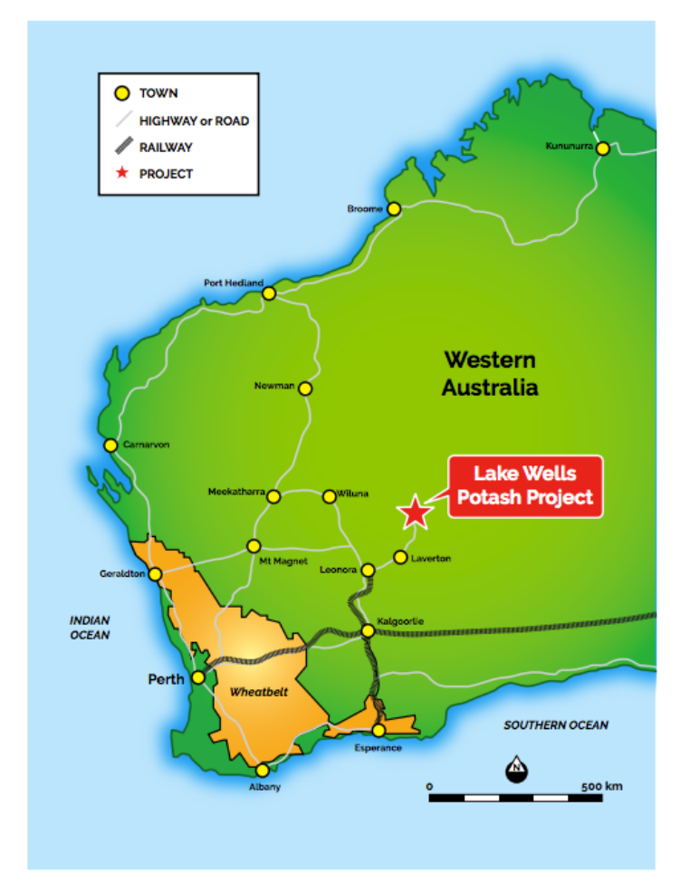
Figure 3: The Lake Wells Potash Project is located 300kms from the Leonora rail head in WA's Eastern Goldfields

A Scoping Study on the Lake Wells Potash Project was completed and released on 23 March 2017<sup>4</sup>. The Scoping Study exceeded expectations and confirmed that the Project's economic and technical aspects are all exceptionally strong, and highlights APC's potential to become a significant long-life, low capital and high margin sulphate of potash (SOP) producer.