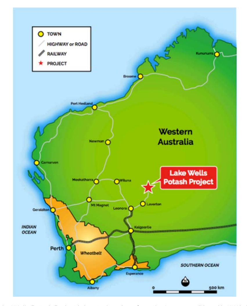
Figure 3: The Lake Wells Potash Project is located 300kms from the Leonora rail head in WA's Eastern Goldfields