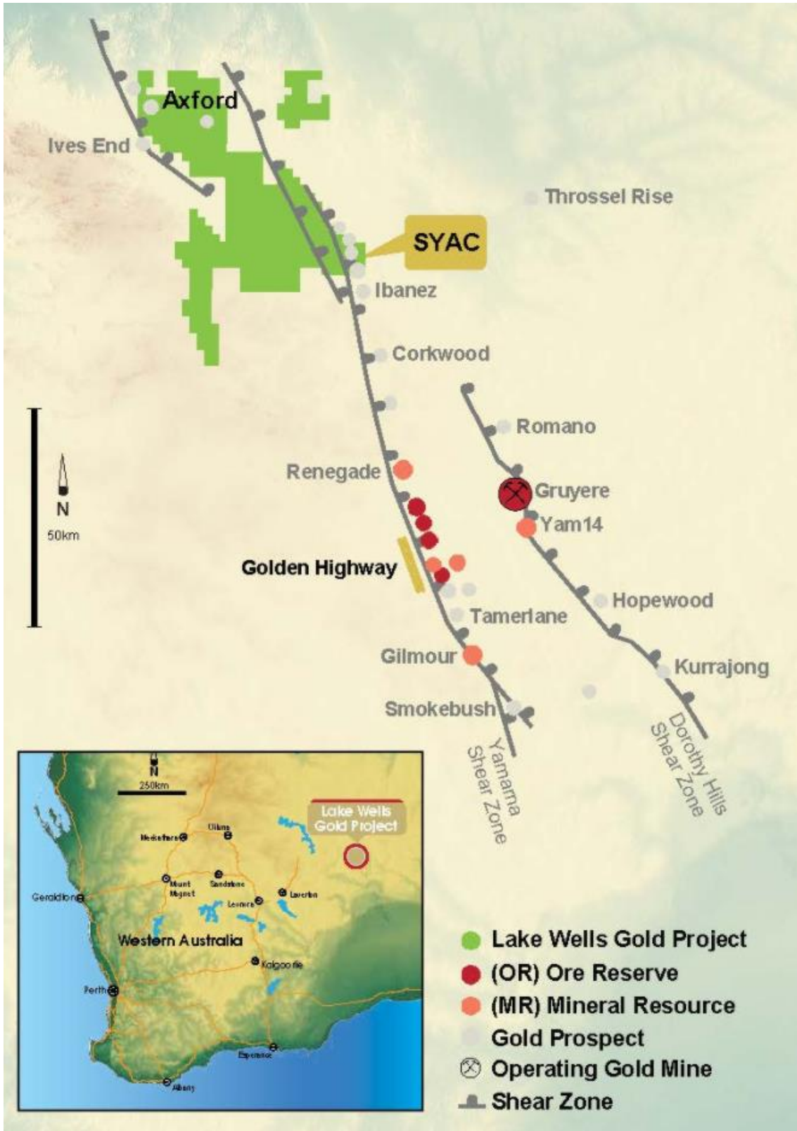
Figure 1: Project location map showing the South Yamarna Anomaly Camp (SYAC)