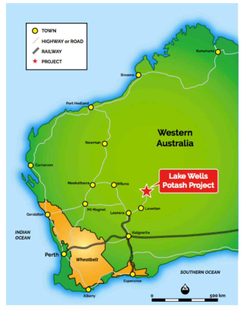
Figure 2: The Lake Wells Potash Project is located 300kms from the Leonora rail head in WA's Eastern Goldfields

The Lake Wells Potash Project is a palaeochannel brine hosted sulphate of potash project. Palaeochannel bore fields supply large volumes of brine to many existing mining operations throughout Western Australia, and this technique is a well understood and proven method for extracting brine. APC will use this technically low-risk and commonly used brine extraction model to further develop a bore-field into the palaeochannel hosting the Lake Wells SOP resource.