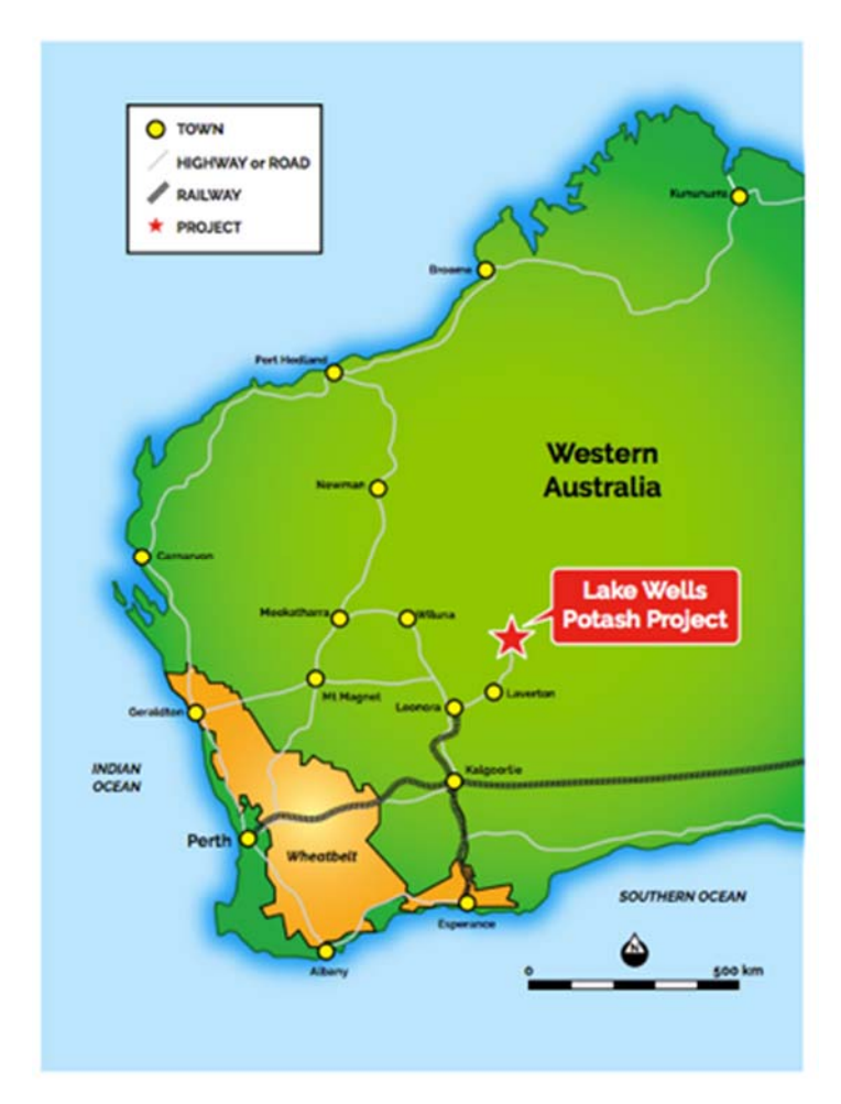
Figure 1: The Lake Wells Potash Project is located 300kms from the Leonora rail head in WA's Eastern Goldfields

A Scoping Study on the Lake Wells Potash Project was completed and released on 23 March 2017<sup>2</sup>. The Scoping Study exceeded expectations and confirmed that the Project's economic and technical aspects are all exceptionally strong, and highlights APC's potential to become a significant long-life, low capital and high margin sulphate of potash (SOP) producer.