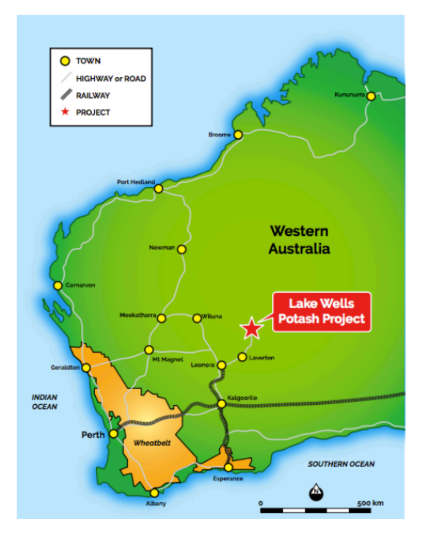
Figure 2: The Lake Wells Potash Project is located 300kms from the Leonora rail head in WA's Eastern Goldfields

A Scoping Study on the Lake Wells Potash Project was completed and released on 23 March 2017<sup>1</sup>. The Scoping Study exceeded expectations and confirmed that the Project's economic and technical aspects are all exceptionally strong, and highlights APC's potential to become a significant long-life, low capital and high margin sulphate of potash (SOP) producer.