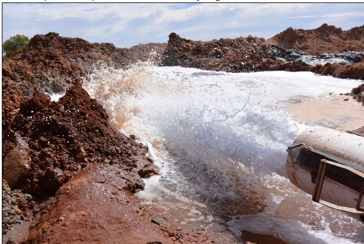
Figure 3: Airlift development operations into containment bunds at the Lake Wells Potash Project

To test for additional production potential, Goldphyre constructed a test production bore into the secondary target, the upper aquifer. The upper aquifer at site A (Figure 6) yielded airlift development rates of 8 litres per second, and test pumping will identify the additional production potential of this secondary target.