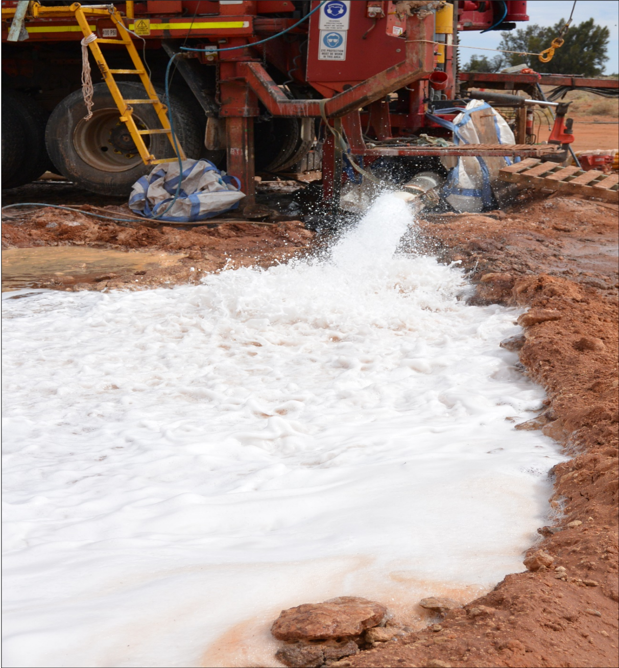
Figure 2: Airlift development yields from test production bore installed nearby proposed evaporation pond site

These airlift development yields again reinforce the quality of the Lake Wells Resource and its potential to support an SOP operation. Goldphyre has previously identified the size and grade of the brine aquifers, the project location puts it in a very advantageous logistical position and now with these airlift development yields, we have further confidence in the exceptional production flows that can be achieved.”