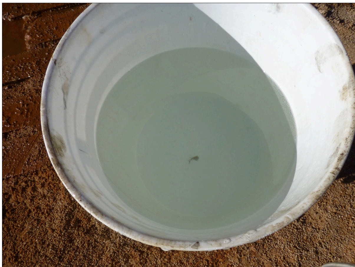
Figure 4: Airlift development continued until a clear brine was produced at each bore

In line with all of its previous exploration and development work on the Lake Wells Potash Project, management are firmly committed to ensuring that the most rigorous techniques and practices are applied to all test work. Adhering to a comprehensive test-pumping regime will allow the Company to confidently release actual results of the test-pumping program without extrapolation or modelling of 'potential' yields.