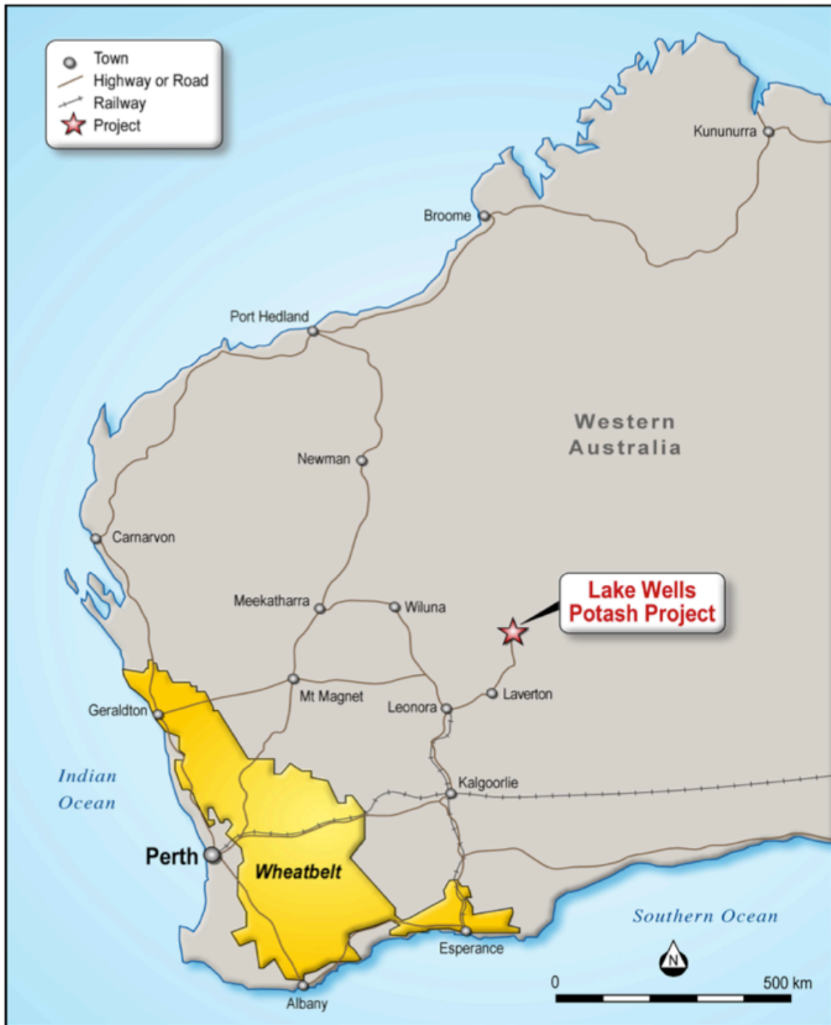
Figure 5: The Lake Wells Potash Project is ideally located proximate to end-users, and established transport infrastructure