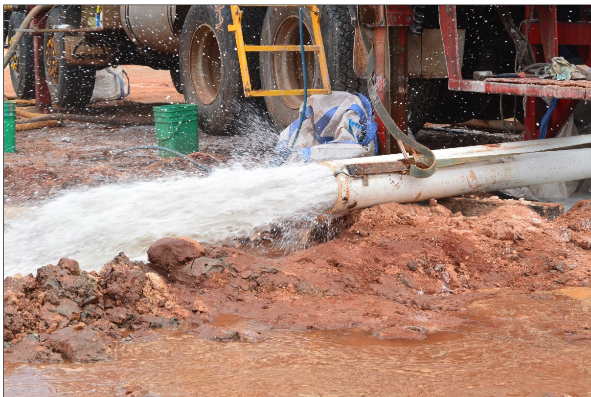
Figure 1: Airlift development yields at Goldphyre's Lake Wells Potash Project are outstanding

Goldphyre's Executive Chairman Matt Shackleton said, "We've been able to demonstrate exceptional airlift development yields beyond our expectations, which are at the upper range for palaeochannel bores in the Eastern Goldfields. These bores are installed in the core, high-grade zone of the brine sulphate of potash Resource ii , nearby the proposed evaporation pond site.