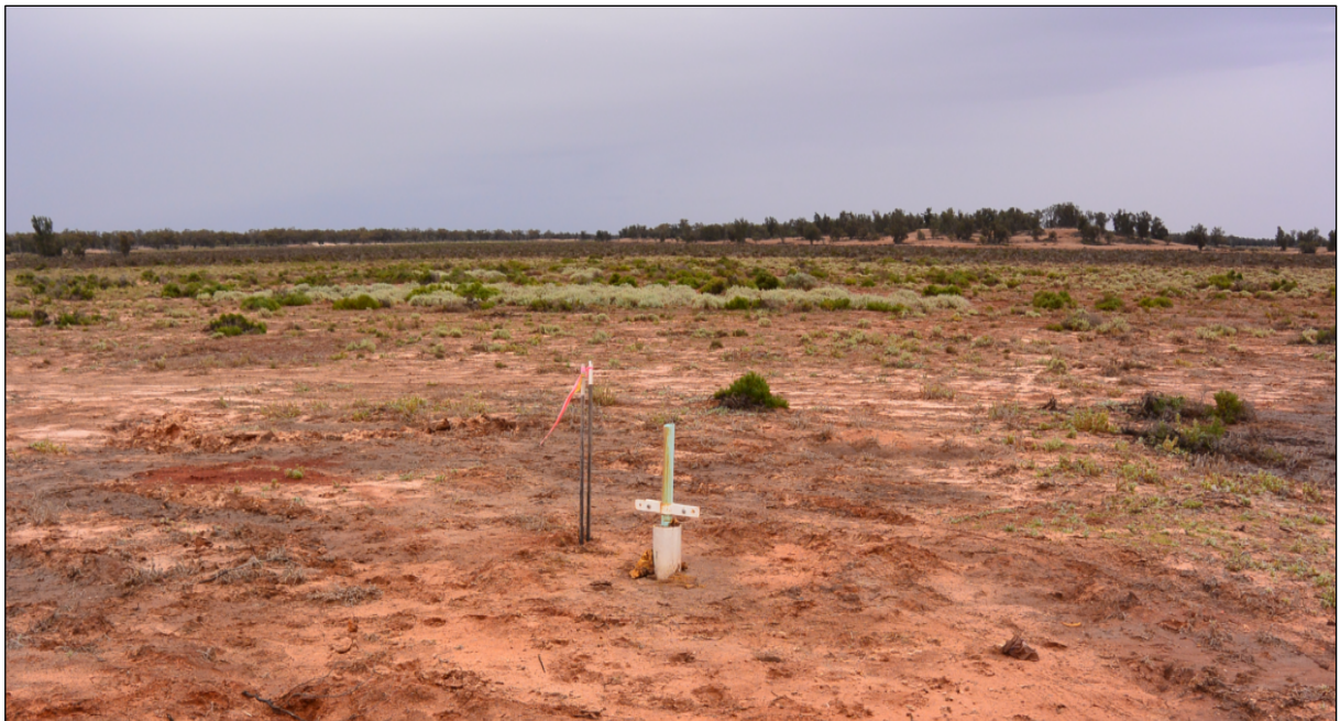
Figure 4: Site B , bore location with view east across salt lake surface

The four test-production bores will be installed at two sites, with a shallow bore into the upper aquifer and a deeper bore into the basal aquifer at each site. The Company is reviewing consultant proposals to conduct the test-pumping program, scheduled to commence upon the completion of the bore installation program, with results expected in the December quarter.