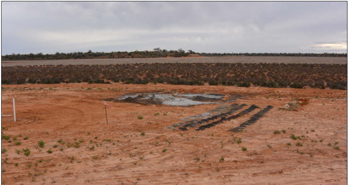
Figure 3: Site A , bore location with view south to lake surface